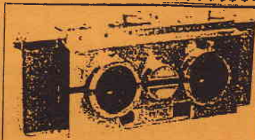
STEREO CORPORATION (Milwaukee, Wisc.) Contura - ca. mid-1950's. Stereo camera designed by Seton Rochwite, who also designed the Stereo Realist for the David White Co.

interest. Only 130 cameras were made and were sold to stockholders at $100 each. Today, they fetch a premium of over $1,000. Good luck finding one!